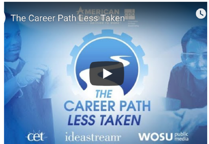
The Career Path Less Taken Video