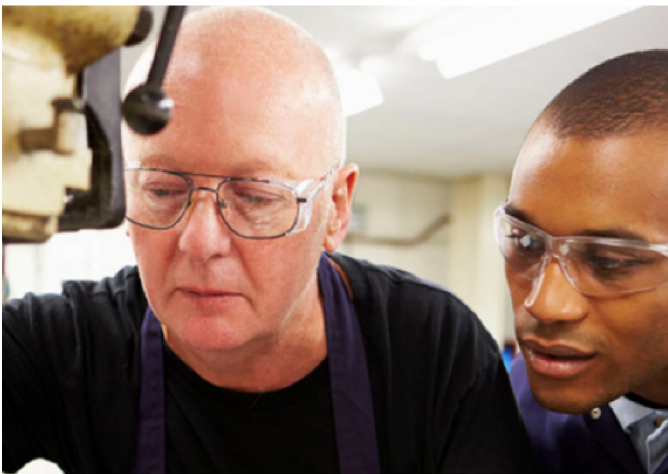
Ohio Apprenticeship & Training Programs

HTTPS://WWW.IBUILDAMERICA-OHIO.COM/TRAINING/APPRENTICESHIPS/