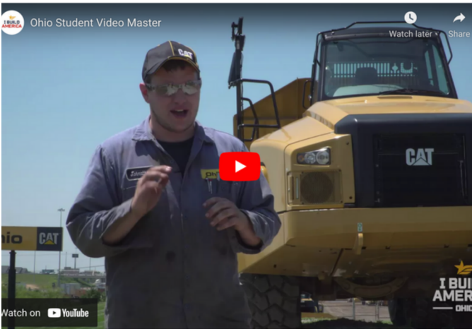
I Build America Ohio – Student Video