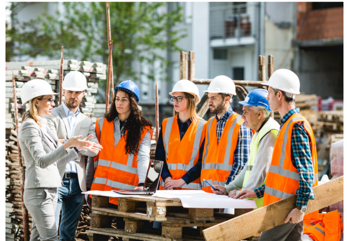
Ohio Scholarship Opportunities and Applications

HTTPS://WWW.IBUILDAMERICA-OHIO.COM/TRAINING/APPRENTICESHIPS/